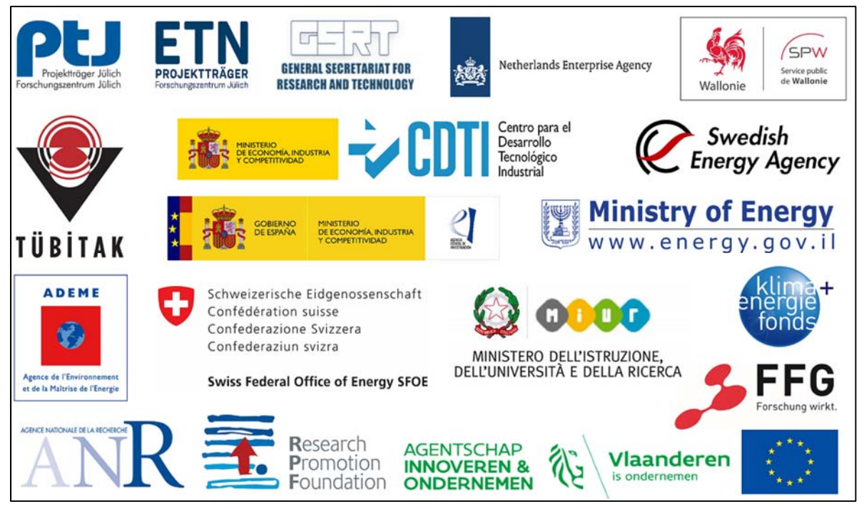
Figure 1: Organisations involved in promoting the SOLAR-ERA.NET Cofund 2 Joint Call and providing support and funding to innovative transnational projects.

The participating national SOLAR-ERA.NET partners / contact points are listed in Table 1. Each applicant have to check the project idea with the national contact point as early as possible in the preproposal phase, at the latest before submitting any applications.